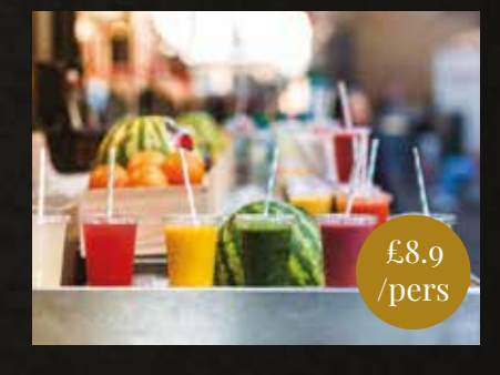
Smoothie bar station

Selection of chicken, lamb and halloumi skewers (halal, GF, vegan option available)