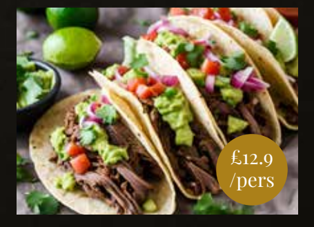
Tacos Pop Up

At least 3 different soups available, includes bread (Vegan & Gluten free available)