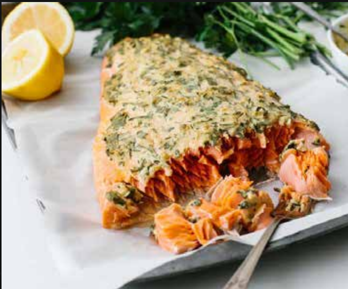
Baked salmon fillet with roast potatoes