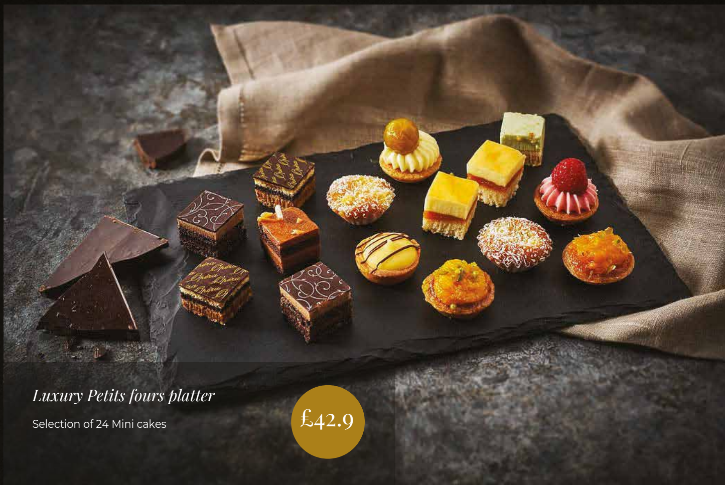
Luxury Petits fours platter