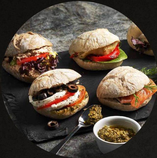
Mini baguette platter

(4-6 ppl) 12 mini baguettes (mix of meat fish, veggie and vegan options)