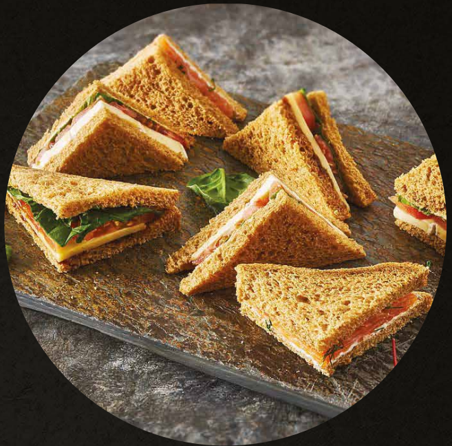
British sandwich platter

(4-5 ppl) 20 quarters with a selection of meat, fish and veggie fillings