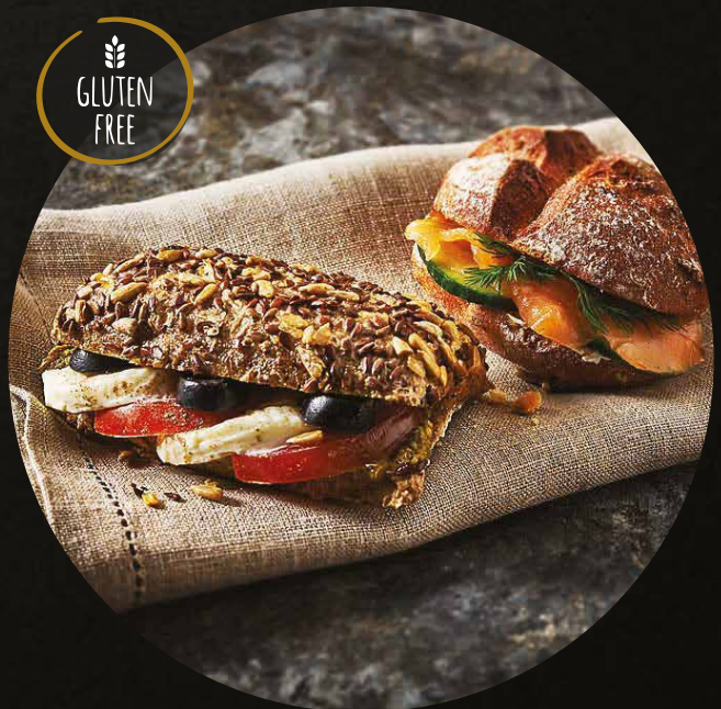
Gluten free lunch box