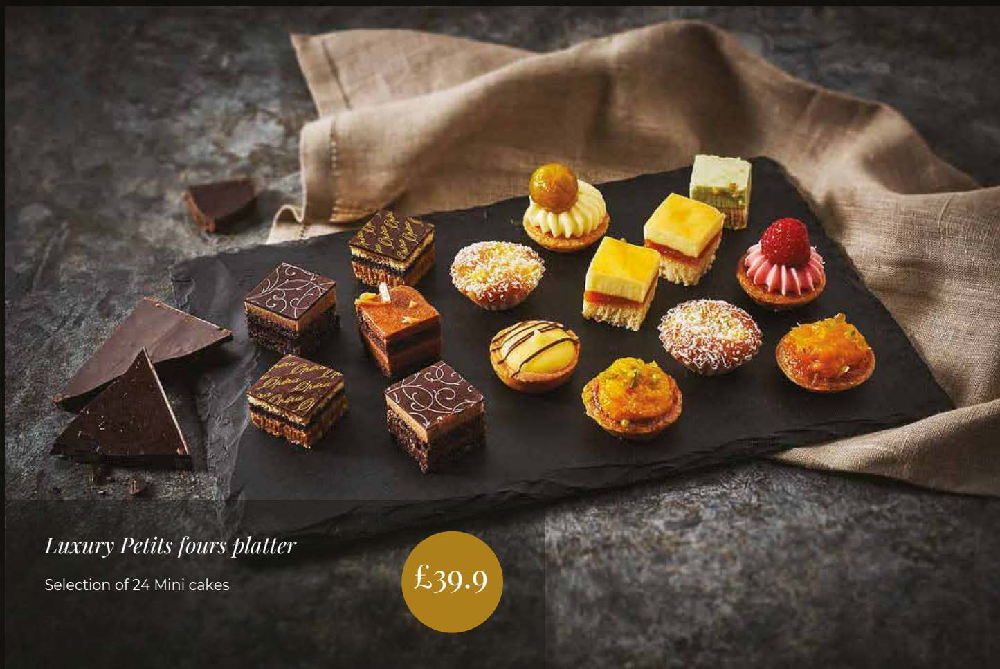
Luxury Petits fours platter