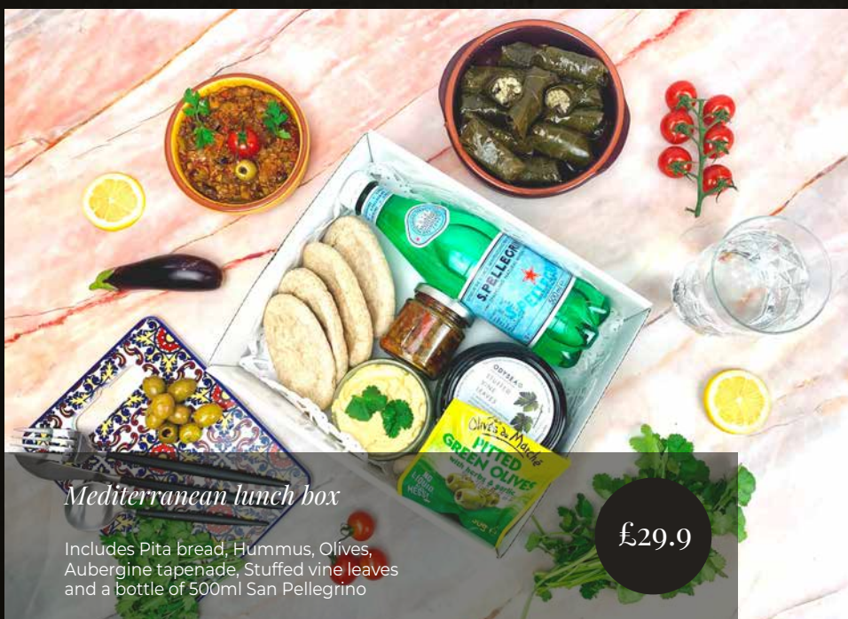
Mediterranean lunch box

Includes Pita bread, Hummus, Olives, Aubergine tapenade, Stuffed vine leaves and a bottle of 500ml San Pellegrino