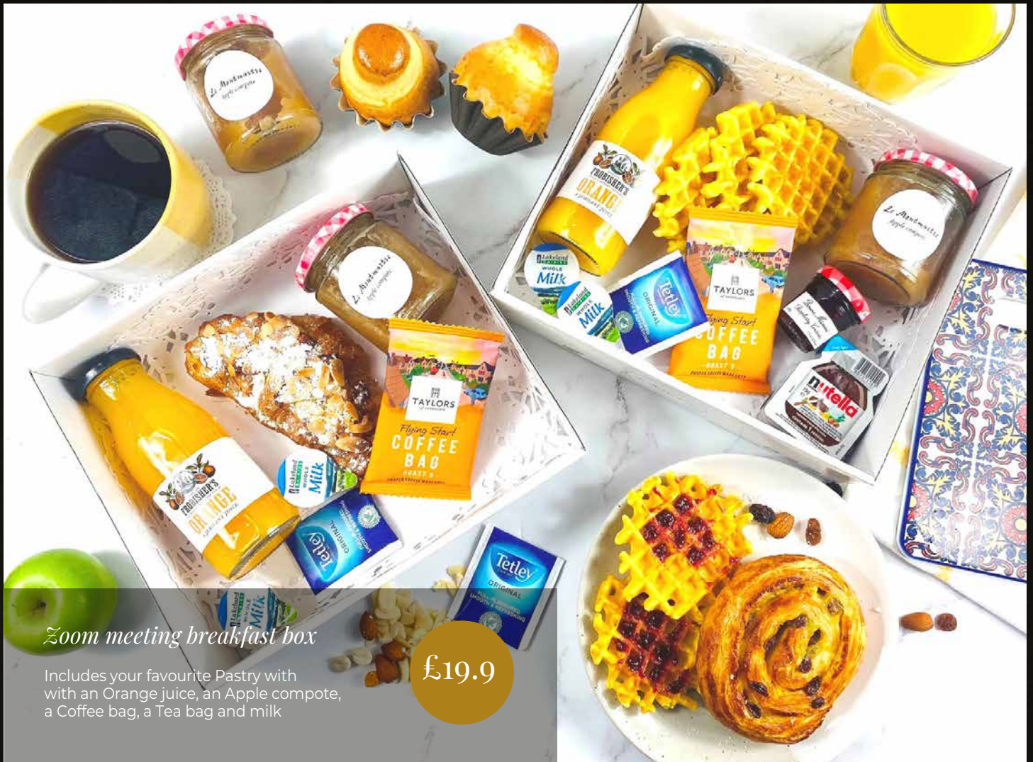
Zoom meeting breakfast box

Includes your favourite Pastry with an Orange juice, an Apple compote, a Coffee bag, a Tea bag and milk